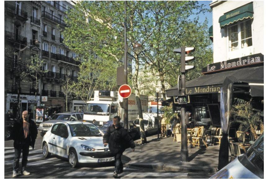
Le Mondrian restaurant, Paris

of the outward. 'Une blanquette de veau!' The young woman puts water, the young man puts water in his wine, yet takes no liqueur.