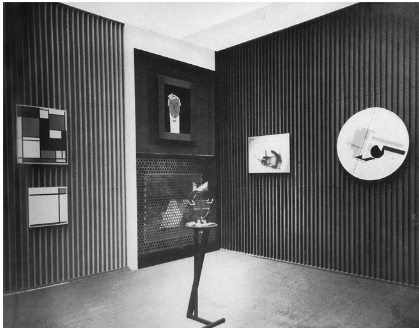
El Lissitzky's Dresden room

“ If the visitor stood at the west entrance to the Dresden space she or he found directly ahead – and thus on gray – an enlargement of Lissitzky’s photo- graph , Untitled ( Hand with Compasses ) , ( 1924 ) , ... and his gouache – and – paper Round Proun ( 1926 ) . From the same stand point , Mondrian’s paintings on the wall to the left – the north wall – appeared on white . As the visitor entered the gallery and moved closer to Lissitzky’s works , the north wall gradually turned to black through an infinitesimal range of shades of gray . This process of architectural chiaroscuro was reversed in the case of the south wall , to the visitor’s right , which shifted from black to gray to white as the visitor approached Lissitzky’s work . Entering via the Dresden Raum’s south entrance , however , the visitor found Mondrian’s work directly ahead on gray , Lissitzky’s work to the right on a black wall that transformed into white as she or he moved closer to the north wall , and so on , ad infinitum “